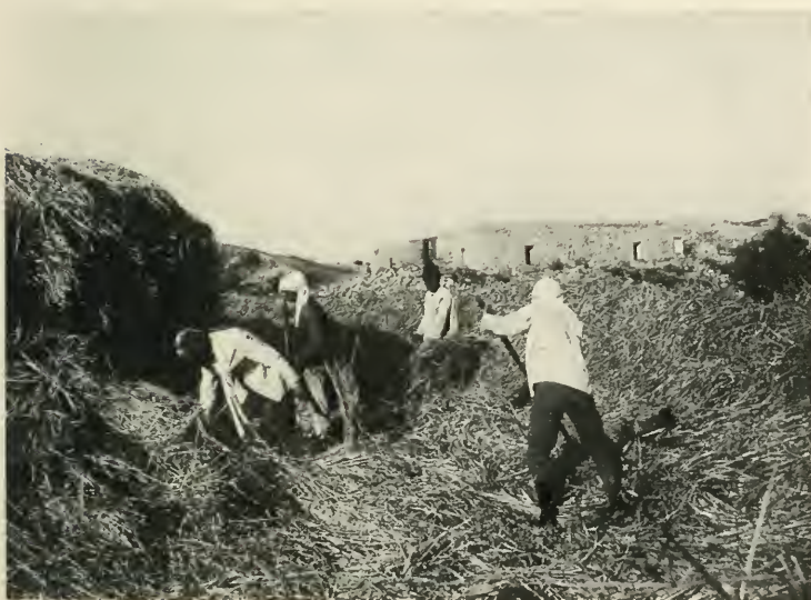
Colonists at Work