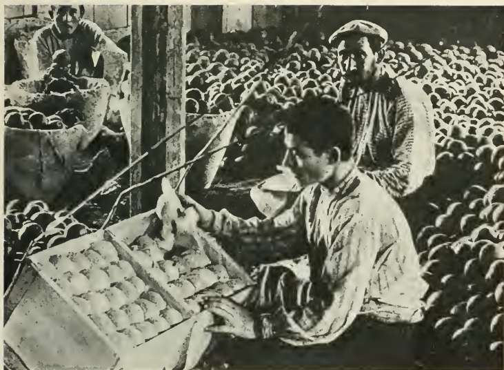
Packing Oranges for Export