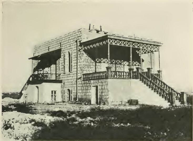
A Colonist's House