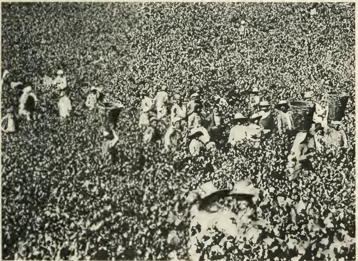
The Wine Harvest