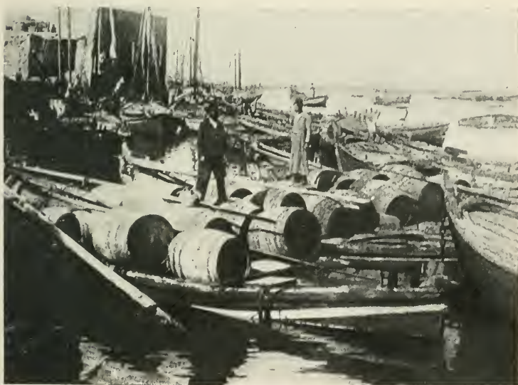
Loading Wine at Jaffa