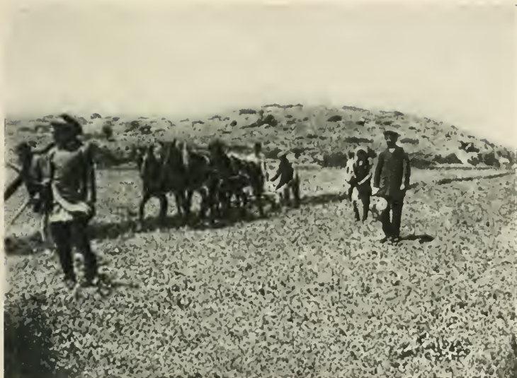
Breaking the Soil After Two Thousand Years