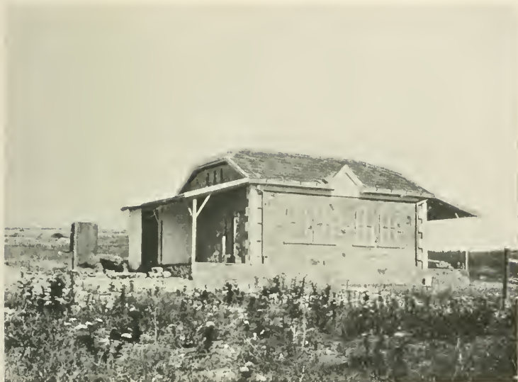
A Labourer's House