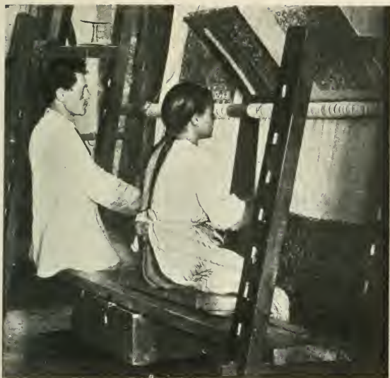
Weaving Carpets in the Bezalel