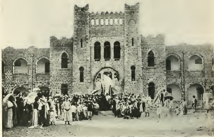
The Jaffa Gymnasium en Fête