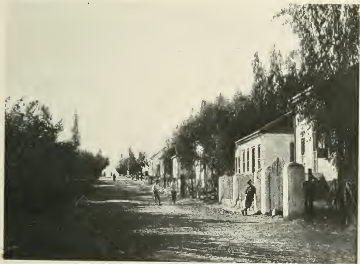
A Street in Petach Tikvah