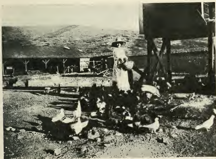
A Colonist's Wife at Kinnereth