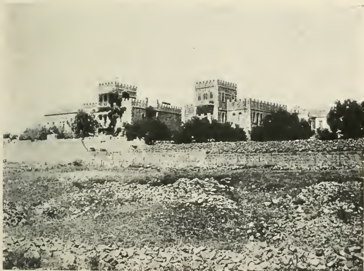
The Bezalel School