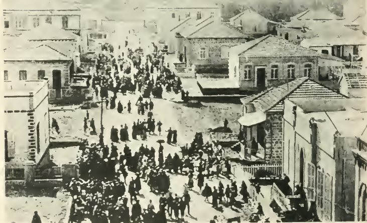
A Festival at Tel Aviv