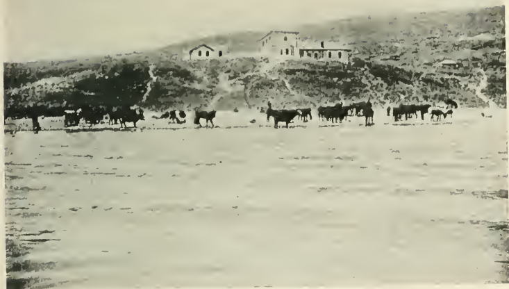
The Farm at Kinnereth