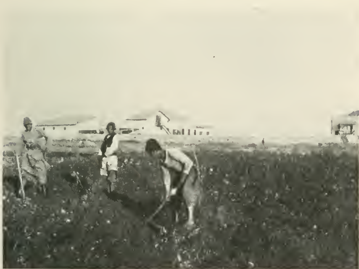
Yemenite Boys at Work