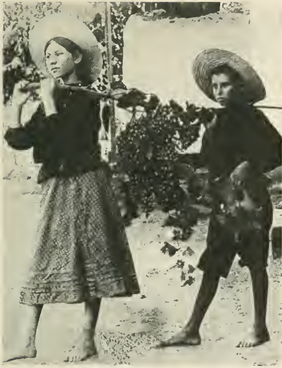
The Produce of the Land